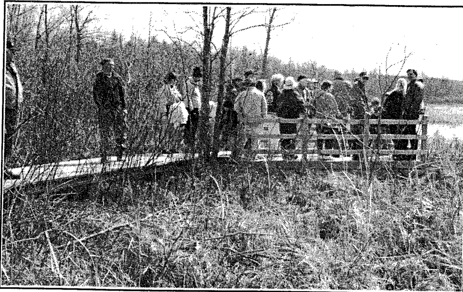
SAVORING A SWEEPING view of Sinclair River marshlands opened by the new boardwalk was just one of the Earth Day activities pursued by the group. They also planted over 800 trees and took tours of the other two preserves that form the 86-acre SCL-SML Natural Area.